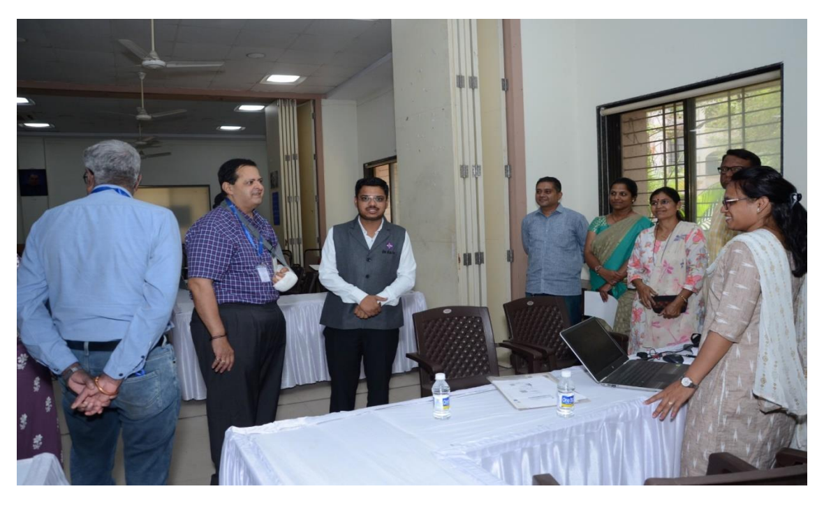
\frac{\textbf{Compliance Drive for Entrepreneurs in association with DeAsara Foundationat}}{\underline{\textbf{Ahmednagar}}}