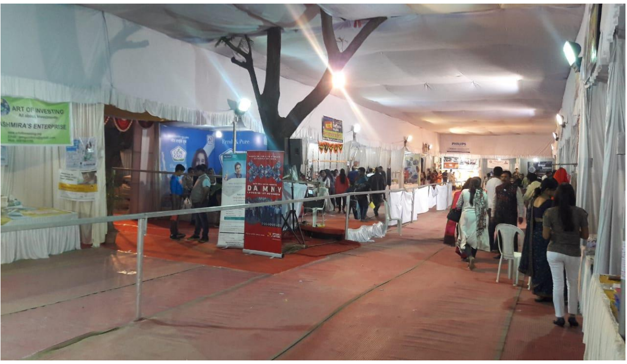
Women's Entrepreneurship Expo