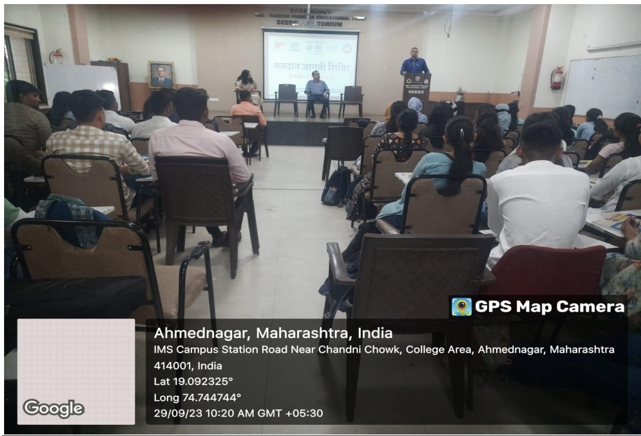
Electoral Literacy Program